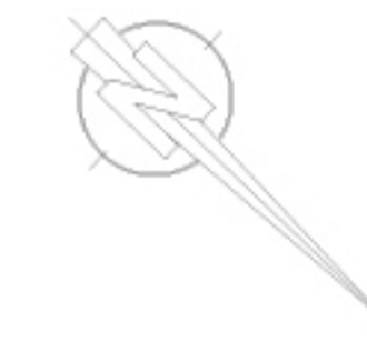
SITUATION DE L'APPARTEMENT A L'ETAGE